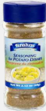
SEASONING FOR POTATO DISHES PRZYPRAWA DO ZIEMNIAKÓW 2.12 oz | 60 g | 6 units UPC# 820213136408