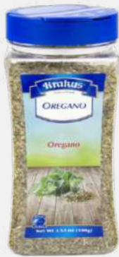
OREGANO OREGANO 3.53 oz | 100 g | 6 units UPC# 820213136644