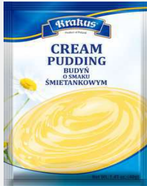
CREAM PUDDING BUDYŃ O SMAKU ŚMIETANKOWYM 1.41 oz l 40 g l 30 units UPC# 820213068860