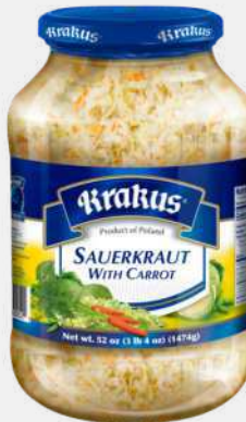
SAUERKRAUT WITH CARROT KAPUSTA KISZONA Z MARCHEWKA 52 oz | 1.47 kg | 6 units UPC# 820213101932