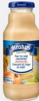
SOUR RYE SOUP CONCENTRATE KONCENTRAT ŻURKU 10.14 fl oz | 300 ml | 6 units UPC# 820213001805