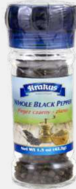
WHOLE BLACK PEPPER PIEPRZ CZARNY W ZIARNACH 1.5 oz | 42.5 g | 6 units UPC# 820213136200