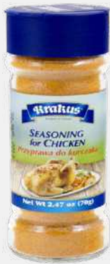
SEASONING FOR CHICKEN PRZYPRAWA DO KURCZAKA 2.47 oz | 70 g | 6 units UPC# 820213136507