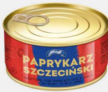
FISH SPREAD WITH RICE & TOMATO PAPRYKARZ SZCZECIŃSKI 10.58 oz l 300 g l 12 units UPC# 820213133322