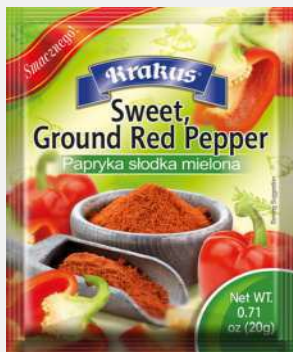
SWEET GROUND PEPPER PAPRYKA SŁODKA MIELONA 0.71 oz l 20 g l 28 units UPC# 820213137160