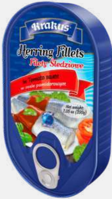
HERRING FILLETS IN TOMATO SAUCE ŚLEDZI W SOSIE POMIDOROWYM 7.05 oz l 200 g l 10 units UPC# 820213133001