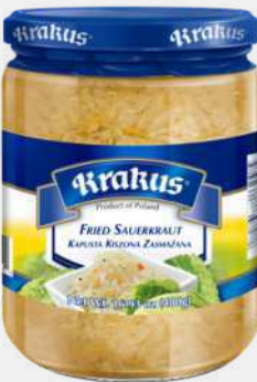
FRIED SAUERKRAUT KAPUSTA KISZONA ZASMAŻANA 16.93 oz | 480 g | 12 units UPC# 820213100904