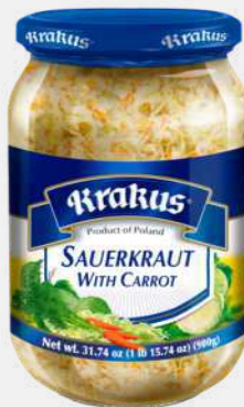
SAUERKRAUT WITH CARROT KAPUSTA KISZONA Z MARCHEWKA 31.74 oz | 900 g | 12 units UPC# 820213101413