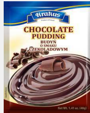
CHOCOLATE PUDDING BUDYŃ O SMAKU CZEKOLADOWYM 1.41 oz l 40 g l 30 units UPC# 820213068884