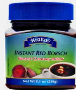
INSTANT RED BORSCHT BARSZCZ CZERWONY INSTANT 8.10 oz | 230 g | 6 units UPC# 820213136163