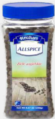
ALLSPICE ZIELE ANGIELSKIE 8.47 oz | 240 g | 6 units UPC# 820213136026