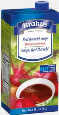
RED BORSCHT SOUP ZUPA BARSZCZ CZERWONY 33.8 fl oz | 1 L | 8 units UPC# 820213001980