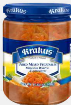
FRIED MIXED VEGETABLES MIESZANKA WARZYW ZASMAŻANYCH 17.64 oz | 500 g | 12 units UPC# 820213100843