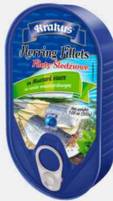
HERRING FILLETS IN MUSTARD SAUCE ŚLEDZI W SOSIE MUSZTARDOWYM 7.05 oz l 200 g l 10 units UPC# 820213133063