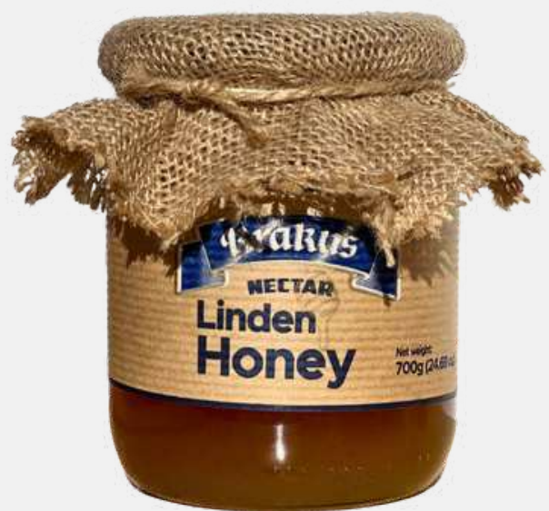
LINDEN HONEY NECTAR MIOD NEKTAROWY LIPOWY 24.7 oz | 700 g | 6 units UPC# 820213133681