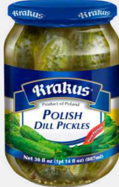
POLISH DILL PICKLES OGÓRKI KONSERWOWE 30 fl oz | 887 ml | 12 units UPC# 820213101673