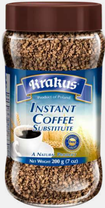
INSTANT COFFEE SUBSTITUTE JAR KAWA ZBOŻOWA - SŁOIK 7 oz l 200 g l 12 units UPC# 820213100225