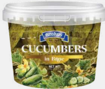
CUCUMBERS IN BRINE (BUCKET) OGÓRKI KISZONE 40.56 oz | 1.15 kg | 6 units UPC# 820213124566