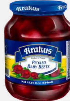
PICKLED BABY BEETS BURACZKI KONSERWOWE CAŁE 15.01 fl oz | 444 ml | 12 units UPC# 820213101192