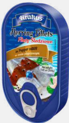
HERRING FILLETS IN PEPPER SAUCE ŚLEDZI W SOSIE PIEPRZOWYM 7.05 oz l 200 g l 10 units UPC# 820213133032