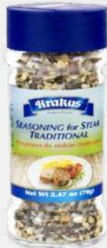
SEASONING FOR STEAK PRZYPRAWA DO STEKÓW TRADYCYJNA 2.47 oz | 70 g | 6 units UPC# 820213136125