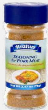
SEASONING FOR PORK MEAT PRZYPRAWA DO MIĘSA WIEPRZOWEGO 2.47 oz | 70 g | 6 units UPC# 820213136361