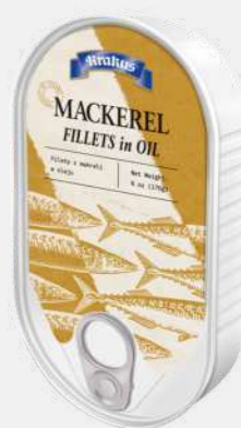
MACKEREL FILLETS IN OIL FILETY Z MAKRELI W OLEJU 6 oz l 170 g l 10 units UPC# 820213133308