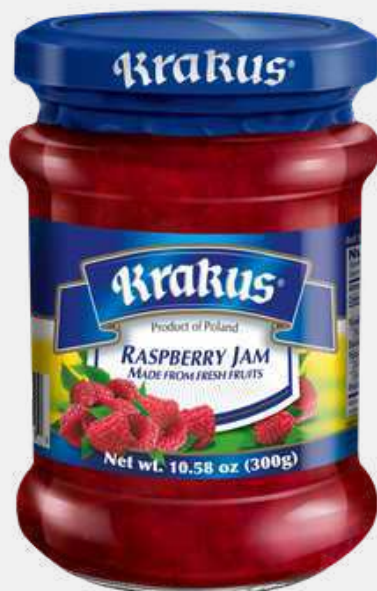
RASPBERRY JAM DŻEM MALINOWY 10.58 oz | 300 g | 6 units UPC# 820213101499