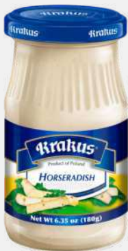
HORSERADISH CHRZAN 6.35 oz l 180 g l 12 units UPC# 820213101253