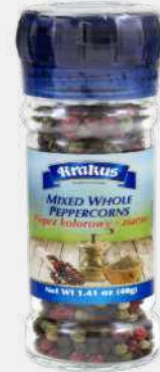
MIXED WHOLE PEPPERCORNS KOLOROWY PIEPRZ W ZIARNACH 1.41 oz | 40 g | 6 units UPC# 820213136224