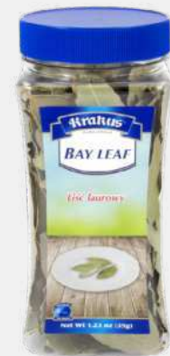
BAY LEAF LIŚĆ LAUROWY 1.23 oz | 35 g | 6 units UPC# 820213136064