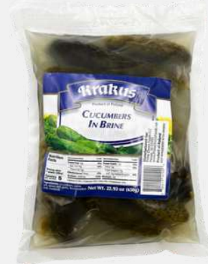
CUCUMBERS IN BRINE (BAG) OGÓRKI KISZONE 22.92 oz | 650 g | 18 units UPC# 820213141006