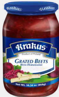
GRATED BEETS WITH HORSE RADISH ĆWIKŁA Z CHRZANEM 30.34 oz | 860 g | 12 units UPC# 820213144021