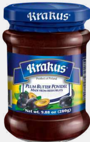
PLUM BUTTER POVIDEL POWIDŁA ŚLIWKOWE 9.88 oz l 280 g l 6 units UPC# 820213101772