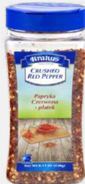
CRUSHED RED PEPPER PAPRYKA CZERWONA - PŁATEK 8.11 oz | 230 g | 6 units UPC# 820213136521