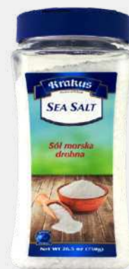
SEA SALT SÓL MORSKA 26.5 oz | 750 g | 6 units UPC# 820213136705