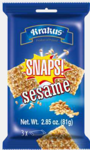
SESAME SNAPS 3-PACK SEZAMKI 3-PAK 2.85 oz | 81 g | 35 units UPC# 820213067009