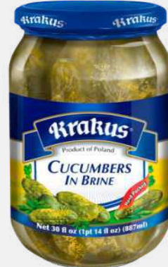
CUCUMBERS IN BRINE OGÓRKI KWASZONE 30 fl oz | 887 ml | 12 units UPC# 820213101599