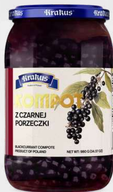
BLACKCURRANT COMPOTE KOMPOT Z CZARNEJ PORZECZKI 34.57 oz l 980 g l 6 units UPC# 820213124559