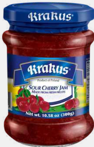
SOUR CHERRY JAM DŻEM WIŚNIOWY 10.58 oz l 300 g l 6 units UPC# 820213101857