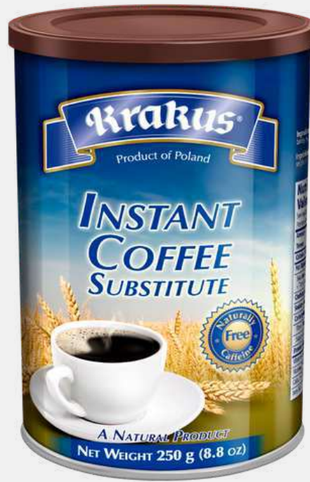
INSTANT COFFEE SUBSTITUTE TIN KAWA ZBOŻOWA - PUSZKA 8.8 oz l 250 g l 12 units UPC# 820213100201