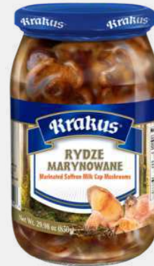
SAFFRON MILK CAP MUSHROOMS RYDZE MARYNOWANE 39.98 oz | 850 g | 12 units UPC# 820213123224