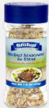
NO-SALT SEASONING FOR STEAK PRZYPRAWA DO STEKÓW BEZ SOLI 1.6 oz | 45 g | 6 units UPC# 820213136149