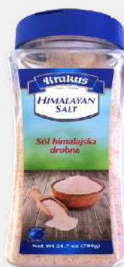
HIMALAYAN SALT SÓL HIMALAJSKA 24.7 oz | 700 g | 6 units UPC# 820213136682