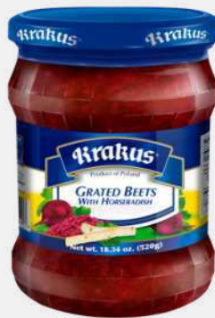
GRATED BEETS WITH HORSE RADISH BURACZKI ĆWIKŁOWE Z CHRZANEM 18.34 oz | 520 g | 6 units UPC# 820213100508