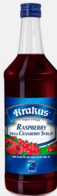
RASPBERRY & CRANBERRY SYRUP SYROP MALINA-ŻURAWINA 33.8 fl oz | 1 L | 6 units UPC# 820213123569