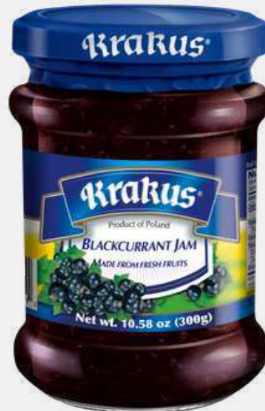
BLACKCURRANT JAM DŻEM Z CZARNEJ PORZECZKI 10.58 oz l 300 g l 6 units UPC# 820213101291