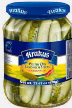
POLISH DILL SANDWICH SLICES OGÓRKI PŁASTRY 23.63 oz | 670 g | 12 units UPC# 820213145028