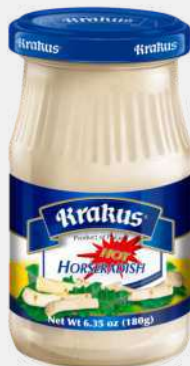
HOT HORSE RADISH CHRZAN OSTRY 6.35 oz l 180 g l 12 units UPC# 820213100805