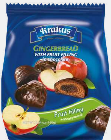
CHOCOLATE COVERED GINGERBREAD WITH FRUIT-FILLING PIERNICZKI OWOCOWE W CZEKOLADZIE 5.64 oz | 160 g | 12 units UPC# 820213129165