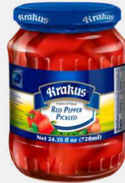
RED PEPPER PICKLED PAPRYKA KONSERWOWA 24.35 fl oz | 720 ml | 24 units UPC# 820213100645