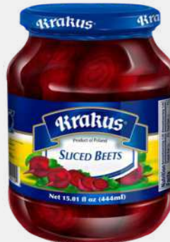
SLICED BEETS BURACZKI KONSERWOWE PLASTRY 15.01 fl oz | 444 ml | 12 units UPC# 820213101178