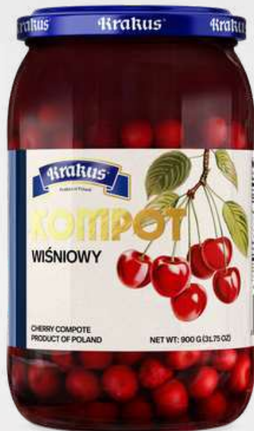
CHERRY COMPOTE KOMPOT WIŚNIOWY 31.75 oz l 900 g l 6 units UPC# 820213124528