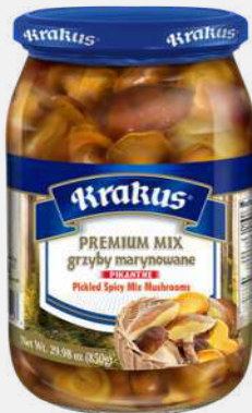
SPICY MIX MUSHROOMS PIKANTNA MIESZANKA GRZYBÓW 29.98 oz | 850 g | 6 units UPC# 820213131748