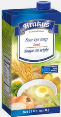
SOUR RYE SOUP ZUPA ŻUREK 33.8 fl oz | 1 L | 8 units UPC# 820213002000