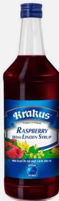
RASPBERRY & LINDEN SYRUP SYROP MALINA-LIPA 33.8 fl oz | 1 L | 6 units UPC# 820213123521