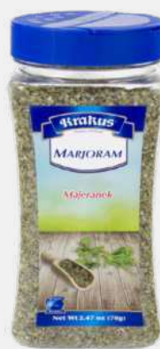
MARJORAM MAJERANEK 2.47 oz | 70 g | 6 units UPC# 820213136040