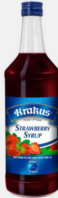
STRAWBERRY SYRUP SYROP TRUSKAWKOWY 33.8 fl oz | 1 L | 6 units UPC# 820213101819