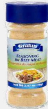
SEASONING FOR BEEF MEAT PRZYPRAWA DO MIĘSA WOŁOWEGO 2.47 oz | 70 g | 6 units UPC# 820213136248