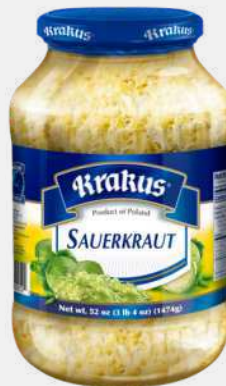
SAUERKRAUT KAPUSTA KISZONA 52 oz | 1.47 kg | 6 units UPC# 820213101451