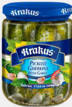
PICKLED GHERKINS WITH GARLIC OGÓRKI KORNISZONY Z CZOSNKIEM 17.64 oz | 500 g | 6 units UPC# 820213145080