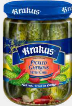
PICKLED GHERKINS WITH CHILI OGÓRKI KORNISZONY Z CHILI 17.64 oz | 500 g | 6 units UPC# 820213145066