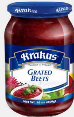
GRATED BEETS BURACZKI TARTE 30 oz | 850 g | 12 units UPC# 820213144007