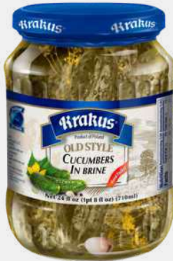
OLD STYLE CUCUMBERS IN BRINE STAROPOLSKIE OGÓRKI KWASZONE - MAŁOSOLNE 24 fl oz | 710 ml | 12 units UPC# 820213144076