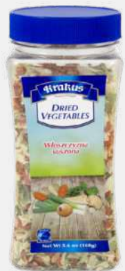
DRIED VEGETABLES WŁOSZCZYŻNA SUSZONA 5.6 oz | 160 g | 6 units UPC# 820213136101