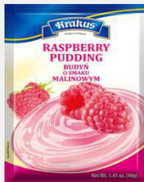
RASPBERRY PUDDING BUDYŃ O SMAKU MALINOWYM 1.41 oz l 40 g l 30 units UPC# 820213068846