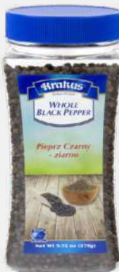
WHOLE BLACK PEPPER PIEPRZ CZARNY W ZIARNACH 9.52 oz | 270 g | 6 units UPC# 820213136583