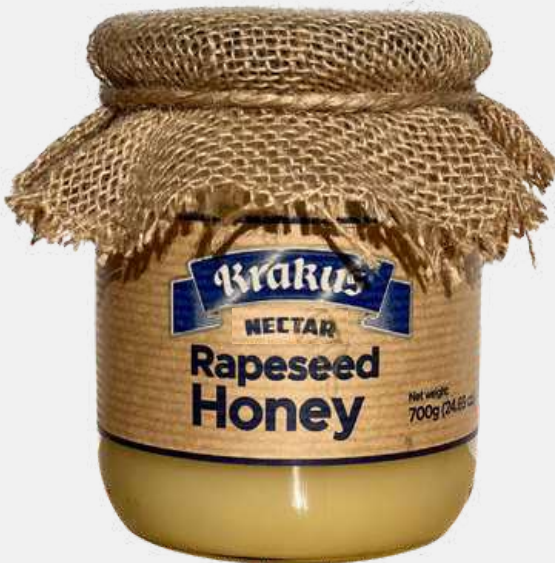
RAPSEED HONEY NECTAR MIOD NEKTAROWY RZEPAKOWY 24.7 oz | 700 g | 6 units UPC# 820213133728