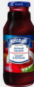
RED BORSCHT CONCENTRATE BARSZCZ CZERWONY KONCENTRAT 10.14 fl oz | 300 ml | 12 units UPC# 820213101154