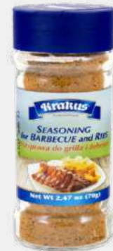
SEASONING FOR BARBECUE & RIBS PRZYPRAWA DO GRILLA I ZEBEREK 2.47 oz | 70 g | 6 units UPC# 820213136286