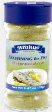
SEASONING FOR FISH PRZYPRAWA DO RYB 2.47 oz | 70 g | 6 units UPC# 820213136460