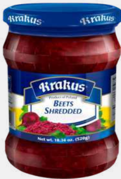
BEETS SHREDDED BURACZKI WIÓRKI 18.34 oz | 520 g | 6 units UPC# 820213100546