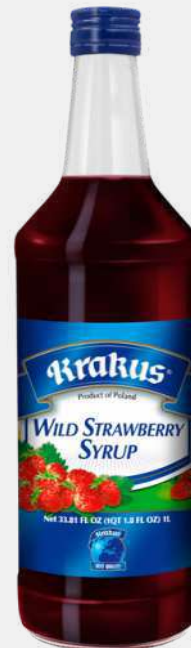
WILD STRAWBERRY SYRUP SYROP POZIOMKOWY 33.8 fl oz | 1 L | 6 units UPC# 820213100980