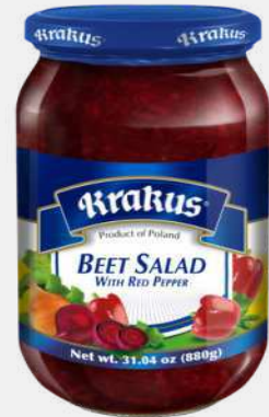
BEET SALAD WITH RED PEPPER SAŁATKA Z BURAKÓW Z PAPRYKĄ 31.04 oz | 880 g | 12 units UPC# 820213144045