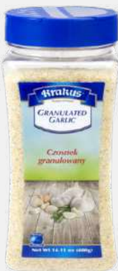
GRANULATED GARLIC CZOSNEK GRANULOWANY 14.11 oz | 400 g | 6 units UPC# 820213136606