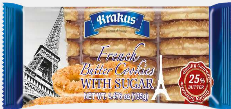
FRENCH BUTTER COOKIES WITH SUGAR PRECLE FRANCUSKIE Z MASŁEM I CUKREM 4.48 oz | 135 g | 14 units UPC# 820213130673