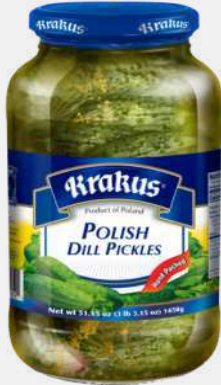
POLISH DILL PICKLES OGÓRKI KONSERWOWE 51 fl oz | 1.5 L | 6 units UPC# 820213101635