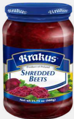
SHREDDED BEETS BURACZKI WIÓRKI 31.74 oz | 900 g | 12 units UPC# 820213125808