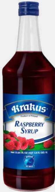
RASPBERRY SYRUP SYROP MALINOWY 33.8 fl oz | 1 L | 6 units UPC# 820213101512