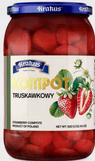
STRAWBERRY COMPOTE KOMPOT TRUSKAWKOWY 32.45 oz l 920 g l 6 units UPC# 820213124535