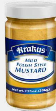
MILD POLISH STYLE MUSTARD MUSZTARDA ŁAGODNA 7.25 oz l 206 g l 12 units UPC# 820213101550