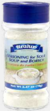
SEASONING FOR SOUR SOUP & BORSCH PRZYPRAWA DO ŻURKU I BARSZCZU 2.47 oz | 70 g | 6 units UPC# 8820213136262