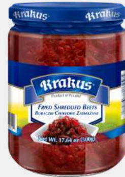
FRIED SHREDDED BEETS BURACZKI ĆWIKŁOWE ZASMAŻANAE 17.64 oz | 500 g | 12 units UPC# 820213100867