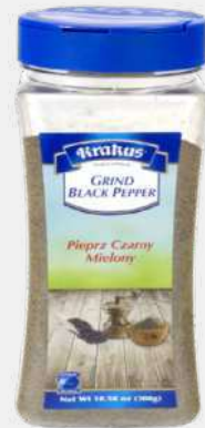
GRIND BLACK PEPPER PIEPRZ CZARNY MIELONY 10.58 oz | 300 g | 6 units UPC# 820213136569