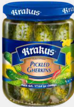
PICKLED GHERKINS OGÓRKI KORNISZONY 17.64 oz | 500 g | 6 units UPC# 820213145042