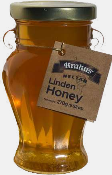
LINDEN HONEY NECTAR MIOD NEKTAROWY LIPOWY 9.52 oz | 270 g | 6 units UPC# 820213133667