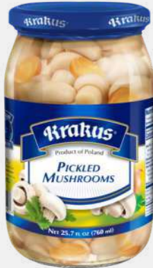
PICKLED MUSHROOMS PIECZARKI MARYNOWANE 25.7 fl oz | 760 ml | 12 units UPC# 820213101970