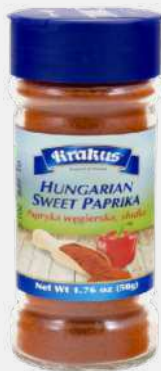
HUNGARIAN SWEET PAPRIKA SŁODKA WĘGIERSKA PAPRYKA 1.76 oz | 50 g | 6 units UPC# 820213136187