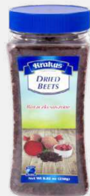
DRIED BEETS BURACZKI SUSZONE 8.82 oz | 250 g | 6 units UPC# 8202131360882