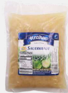
SAUERKRAUT (BAG) KAPUSTA KISZONA 31.99 oz | 907 g | 10 units UPC# 820213123408