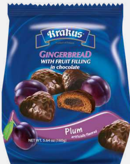
CHOCOLATE COVERED GINGERBREAD WITH PLUM-FILLING PIERNICZKI ŚLIWKOWE W CZEKOLADZIE 5.64 oz | 160 g | 12 units UPC# 820213129189