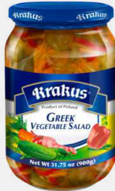
GREEK VEGETABLE SALAD GRECKA SAŁATKA WIELOWARZYWNA 31.75 oz | 900 g | 12 units UPC# 820213125006