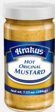
HOT ORIGINAL MUSTARD MUSZTARDA OSTRA 7.25 oz l 206 g l 12 units UPC# 820213101536