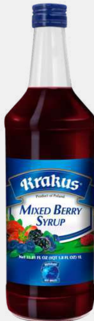
MIXED BERRY SYRUP SYROP LEŚNY 33.8 fl oz | 1 L | 6 units UPC# 820213101918