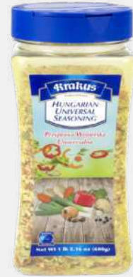
HUNGARIAN UNIVERSAL SEASONING PRZYPRAWA WĘGIERSKA UNIWERSALNA 5.16 oz | 600 g | 6 units UPC# 820213136002