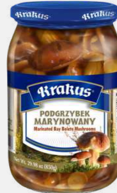
BBAY BOLLETE MUSHROOMS PODGRZYBKI MARYNOWANE 29.98 oz | 850 g | 6 units UPC# 820213131700