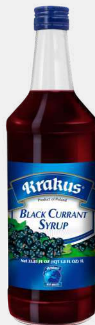
BLACKCURRANT SYRUP SYROP Z CZARNEJ PORZECZKI 33.8 fl oz | 1 L | 6 units UPC# 820213101277