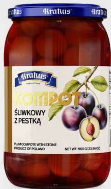
PLUM COMPOTE KOMPOT ŚLIWKOWY Z PESTKĄ 33.86 oz l 960 g l 6 units UPC# 820213124542