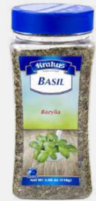
BASIL BAZYLIA 3.88 oz | 110 g | 6 units UPC# 820213136668