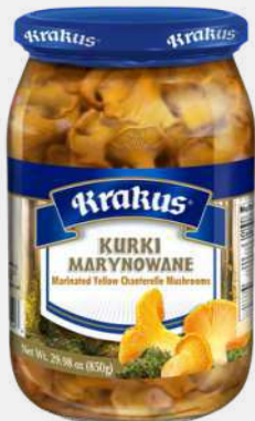
YELLOW CHANTERELLE MUSHROOMS KURKI MARYNOWANE 29.98 oz | 850 g | 6 units UPC# 820213131786