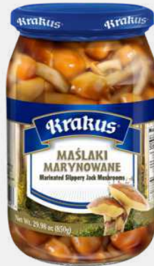
SLIPPERY JACK MUSHROOMS MAŚLANKA MARYNOWANE 29.98 oz | 850 g | 6 units UPC# 820213131809