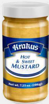
HOT & SWEET MUSTARD MUSZTARDA OSTRO-SŁODKA 7.25 oz l 206 g l 12 units UPC# 820213101574