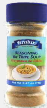
SEASONING FOR TRIPE SOUP PRZYPRAWA DO FLAKÓW 2.47 oz | 70 g | 6 units UPC# 820213136422