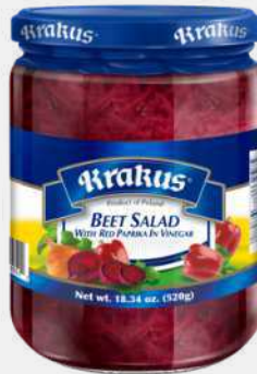
BEET SALAD WITH PAPRIKA SAŁATKA Z BURAKÓW Z PAPRYKĄ 18.34 oz | 520 g | 6 units UPC# 820213100522