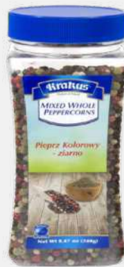
MIXED WHOLE PEPPERCORNS PIEPRZ KOLOROWY W ZIARNACH 8.47 oz | 240 g | 6 units UPC# 820213136620