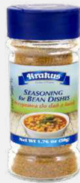
SEASONING FOR BEAN DISHES PRZYPRAWA DO DAŃ Z FASOLI 1.76 oz | 50 g | 6 units UPC# 820213136385