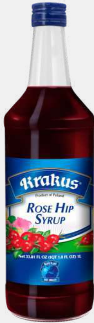
ROSE HIP SYRUP SYROP Z DZIKIEJ RÓŻY 33.8 fl oz | 1 L | 6 units UPC# 820213100966