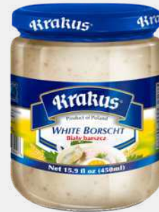
WHITE BORSCHT BIAŁY BARSZCZ 15.9 fl oz | 450 ml | 12 units UPC# 820213123248