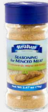
SEASONING FOR MINCED MEAT PRZYPRAWA DO MIĘSA MIELONEGO 2.47 oz | 70 g | 6 units UPC# 820213136347