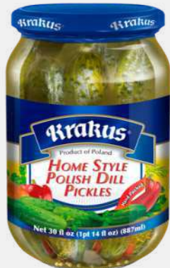
HOME STYLE DILL PICKLES OGÓRKI KONSERWOWE DOMOWE 30 fl oz | 887 ml | 12 units UPC# 820213123224