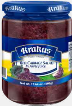
RED CABBAGE SALAD IN APPLE JUICE CZERWONA KAPUSTA Z JABŁKIEM 17.64 oz | 500 g | 6 units UPC# 820213100560