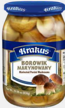
PORCINI MUSHROOMS BOROWIK MARYNOWANY 29.98 oz | 850 g | 6 units UPC# 820213131724