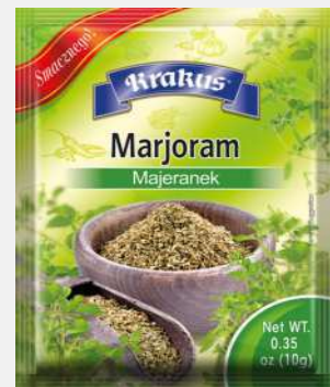
MARJORAM MAJERANEK 0.35 oz l 10 g l 20 units UPC# 820213137146