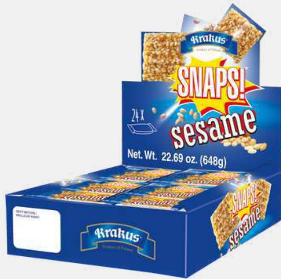
SESAME SNAPS SEZAMKI 0.95 oz | 27 g | 24 units UPC# 820213066996