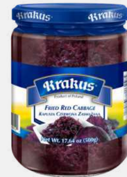
FRIED RED CABBAGE KAPUSTA CZERWONA ZASMAŻANA 17.64 oz | 500 g | 12 units UPC# 820213100881