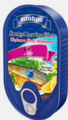
SMOKED HERRING FILLETS IN OIL WĘDZONE FILETY ŚLEDZIOWE W OLEJU 6.7 oz l 190 g l 10 units UPC# 820213133124