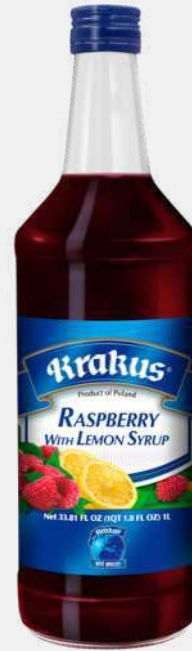
RASPBERRY & LEMON SYRUP SYROP MALIN-CYTRYNA 33.8 fl oz | 1 L | 6 units UPC# 820213123545