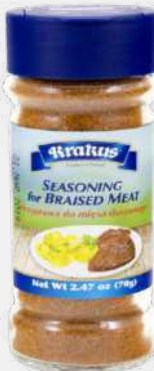
SEASONING FOR BRAISED MEAT PRZYPRAWA DO MIĘSA DUSZONEGO 2.47 oz | 70 g | 6 units UPC# 820213136309