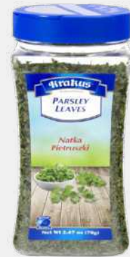
PARSLEY LEAVES NATKA PIETRUSZKI 2.47 oz | 270 g | 6 units UPC# 820213136545