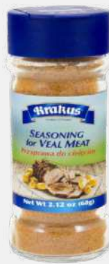
SEASONING FOR VEAL MEAT PRZYPRAWA DO CIEŁĘCINY 2.12 oz | 60 g | 6 units UPC# 820213136323