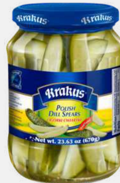
POLISH DILL SPEARS OGÓRKI CWIARTKI 23.63 oz | 670 g | 12 units UPC# 820213145004