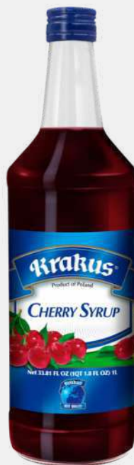
CHERRY SYRUP SYROP WIŚNIOWY 33.8 fl oz | 1 L | 6 units UPC# 820213101871