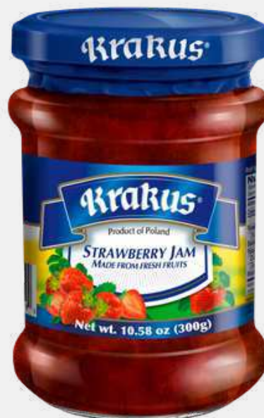
STRAWBERRY JAM DŻEM TRUSKAWKOWY 10.58 oz | 300 g | 6 units UPC# 820213101833