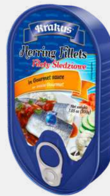
HERRING FILLETS IN GOURMET SAUCE ŚLEDZI W SOSIE GOURMET 7.05 oz l 200 g l 10 units UPC# 820213133094