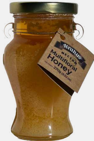
MULTIFLORAL HONEY NECTAR MIOD NEKTAROWY WIELOKWIATOWY 9.52 oz | 270 g | 6 units UPC# 820213133704