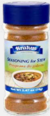
SEASONING FOR STEW PRZYPRAWA DO GULASZU 2.47 oz | 70 g | 6 units UPC# 820213136484