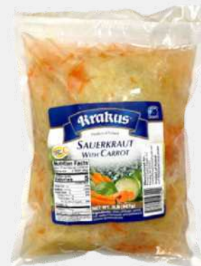
SAUERKRAUT WITH CARROT (BAG) KAPUSTA KISZONA Z MARCHEWKA 31.99 oz | 907 g | 10 units UPC# 820213123422