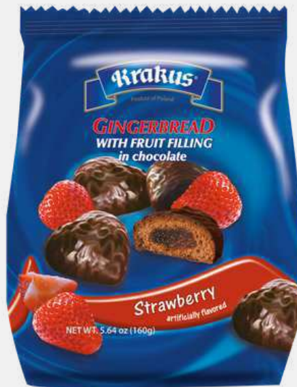
CHOCOLATE COVERED GINGERBREAD WITH STRAWBERRY-FILLING PIERNICZKI TRUSKAWKOWE W CZEKOLADZIE 5.64 oz | 160 g | 12 units UPC# 820213129004