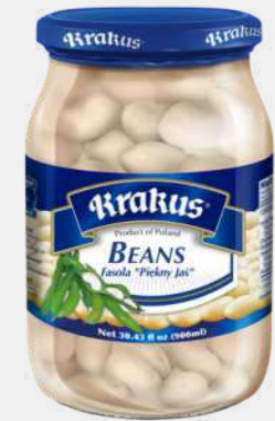
WHITE BEANS FASOLA „PIĘKNY JAS” 30.43 fl oz | 900 ml | 12 units UPC# 820213128540