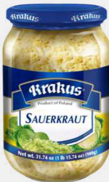
SAUERKRAUT KAPUSTA KISZONA 31.74 oz | 900 g | 12 units UPC# 820213101437