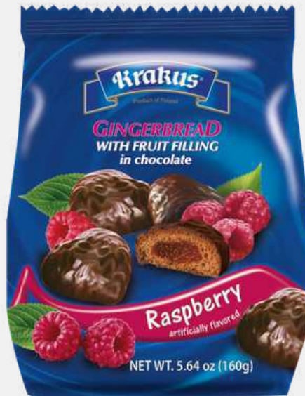
CHOCOLATE COVERED GINGERBREAD WITH RASPBERRY-FILLING PIERNICZKI MALINOWE W CZEKOLADZIE 5.64 oz | 160 g | 12 units UPC# 820213129349