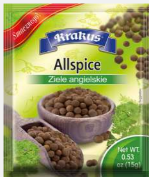
ALL SPICE ZIELE ANGIELSKIE 0.53 oz l 15 g l 20 units UPC# 820213137184