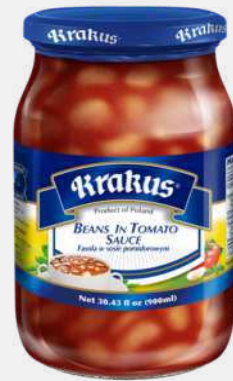
WHITE BEANS IN TOMATO SAUCE FASOLA „PIĘKNY JAS” W SOSIE POMIDOROWYM 30.43 fl oz | 900 ml | 12 units UPC# 820213128564