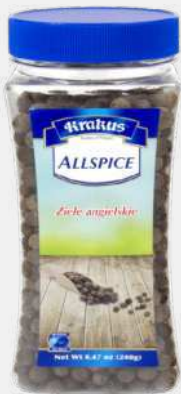
ALLSPICE ZIELE ANGIELSKIE 8.47 oz | 240 g | 6 units UPC# 820213136026