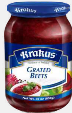
GRATED BEETS BURACZKI TARTE 30 oz | 850 g | 12 units UPC# 820213144007