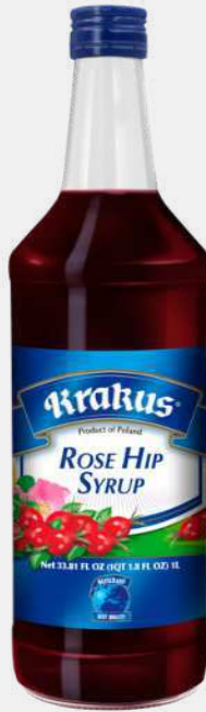
ROSE HIP SYRUP SYROP Z DZIKIEJ RÓŻY 33.8 fl oz | 1 L | 6 units UPC# 820213100966