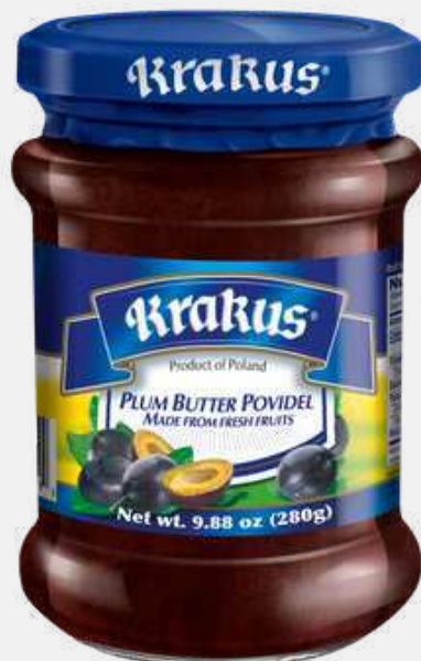
PLUM BUTTER POVIDEL POWIDŁA ŚLIWKOWE 9.88 oz l 280 g l 6 units UPC# 820213101772