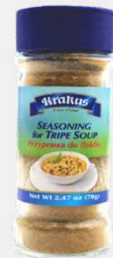
SEASONING FOR TRIPE SOUP PRZYPRAWA DO FLAKÓW 2.47 oz | 70 g | 6 units UPC# 820213136422