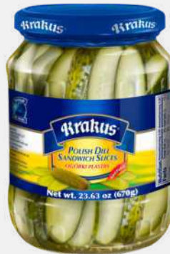
POLISH DILL SANDWICH SLICES OGÓRKI PŁASTRY 23.63 oz | 670 g | 12 units UPC# 820213145028