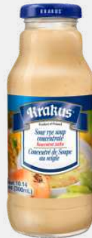
SOUR RYE SOUP CONCENTRATE KONCENTRAT ŻURKU 10.14 fl oz | 300 ml | 6 units UPC# 820213001805