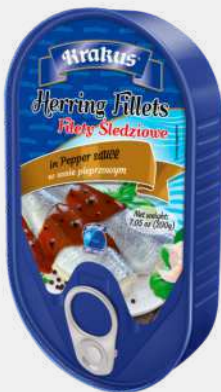
HERRING FILLETS IN PEPPER SAUCE ŚLEDZI W SOSIE PIEPRZOWYM 7.05 oz l 200 g l 10 units UPC# 820213133032