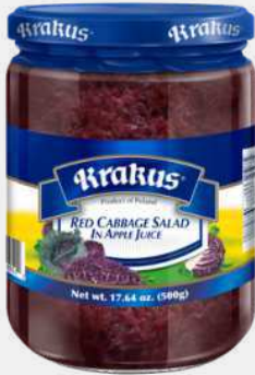
RED CABBAGE SALAD IN APPLE JUICE CZERWONA KAPUSTA Z JABŁKIEM 17.64 oz | 500 g | 6 units UPC# 820213100560