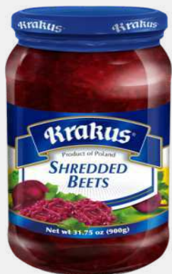
SHREDDED BEETS BURACZKI WIÓRKI 31.74 oz | 900 g | 12 units UPC# 820213125808