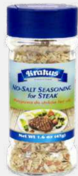
NO-SALT SEASONING FOR STEAK PRZYPRAWA DO STEKÓW BEZ SOLI 1.6 oz | 45 g | 6 units UPC# 820213136149