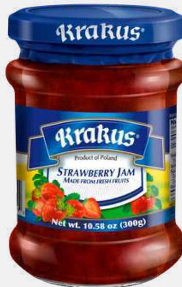
STRAWBERRY JAM DŻEM TRUSKAWKOWY 10.58 oz | 300 g | 6 units UPC# 820213101833