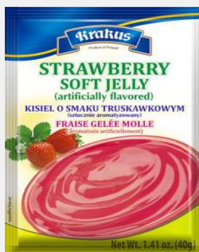
STRAWBERRY SOFT JELLY KISIEL O SMAKU TRUSKAWKOWYM 1.41 oz l 40 g l 30 units UPC# 820213068808