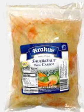
SAUERKRAUT WITH CARROT (BAG) KAPUSTA KISZONA Z MARCHEWKA 31.99 oz | 907 g | 10 units UPC# 820213123422