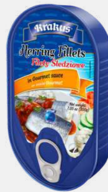
HERRING FILLETS IN GOURMET SAUCE ŚLEDZI W SOSIE GOURMET 7.05 oz l 200 g l 10 units UPC# 820213133094