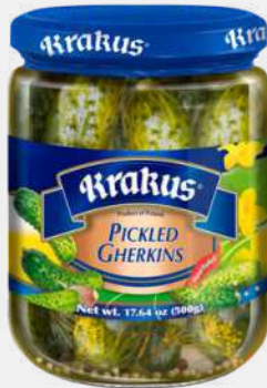
PICKLED GHERKINS OGÓRKI KORNISZONY 17.64 oz | 500 g | 6 units UPC# 820213145042