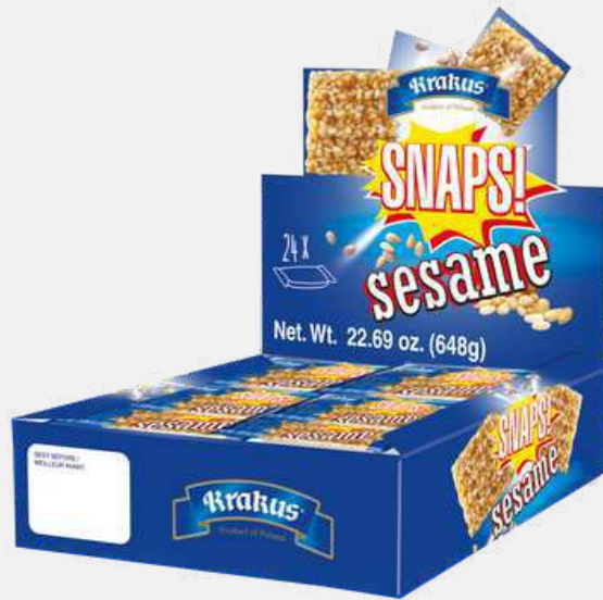
SESAME SNAPS SEZAMKI 0.95 oz | 27 g | 24 units UPC# 820213066996