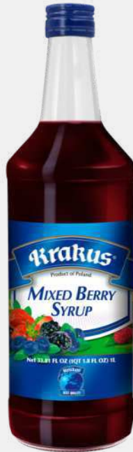
MIXED BERRY SYRUP SYROP LEŚNY 33.8 fl oz | 1 L | 6 units UPC# 820213101918