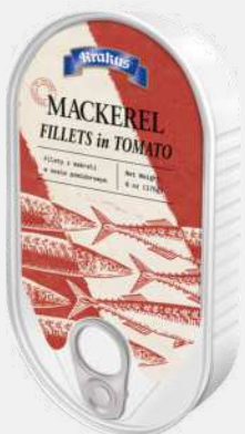
MACKEREL FILLETS IN TOMATO FILETY Z MAKRELI W SOSIE POMIDOROWYM 6 oz l 170 g l 10 units UPC# 820213133315