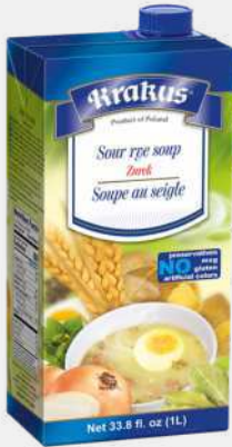
SOUR RYE SOUP ZUPA ŻUREK 33.8 fl oz | 1 L | 8 units UPC# 820213002000