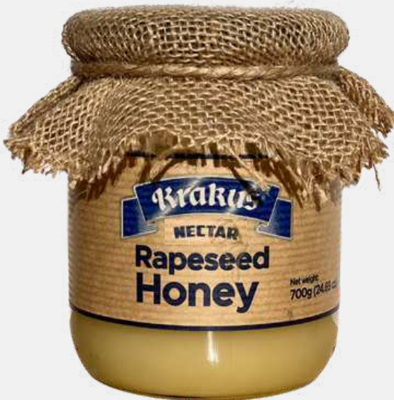
RAPESEED HONEY NECTAR MIOD NEKTAROWY RZEPAKOWY 24.7 oz | 700 g | 6 units UPC# 820213133728