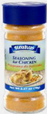
SEASONING FOR CHICKEN PRZYPRAWA DO KURCZAKA 2.47 oz | 70 g | 6 units UPC# 820213136507