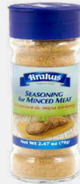
SEASONING FOR MINCED MEAT PRZYPRAWA DO MIĘSA MIELONEGO 2.47 oz | 70 g | 6 units UPC# 820213136347