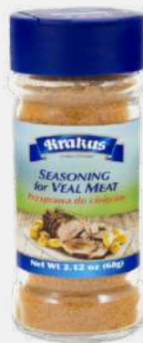
SEASONING FOR VEAL MEAT PRZYPRAWA DO CIEŁĘCINY 2.12 oz | 60 g | 6 units UPC# 820213136323