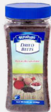
DRIED BEETS BURACZKI SUSZONE 8.82 oz | 250 g | 6 units UPC# 8202131360882