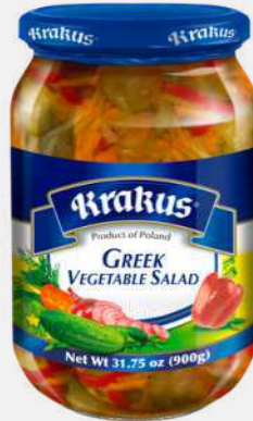
GREEK VEGETABLE SALAD GRECKA SAŁATKA WIELOWARZYWNA 31.75 oz | 900 g | 12 units UPC# 820213125006