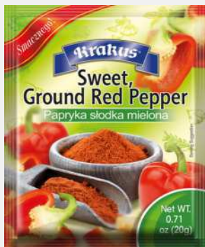
SWEET GROUND PEPPER PAPRYKA SŁODKA MIELONA 0.71 oz l 20 g l 28 units UPC# 820213137160