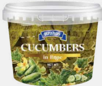
CUCUMBERS IN BRINE (BUCKET) OGÓRKI KISZONE 40.56 oz | 1.15 kg | 6 units UPC# 820213124566