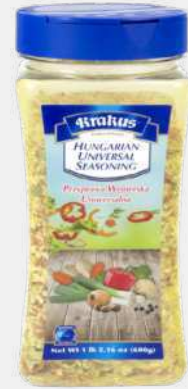
HUNGARIAN UNIVERSAL SEASONING PRZYPRAWA WĘGIERSKA UNIWERSALNA 5.16 oz | 600 g | 6 units UPC# 820213136002