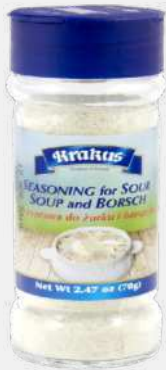
SEASONING FOR SOUR SOUP & BORSCH PRZYPRAWA DO ŻURKU I BARSZCZU 2.47 oz | 70 g | 6 units UPC# 8820213136262