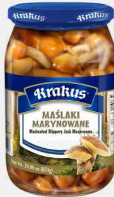
SLIPPERY JACK MUSHROOMS MAŚLANKA MARYNOWANE 29.98 oz | 850 g | 6 units UPC# 820213131809