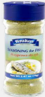
SEASONING FOR FISH PRZYPRAWA DO RYB 2.47 oz | 70 g | 6 units UPC# 820213136460