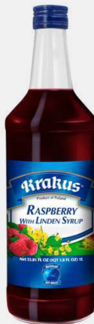
RASPBERRY & LINDEN SYRUP SYROP MALINA-LIPA 33.8 fl oz | 1 L | 6 units UPC# 820213123521