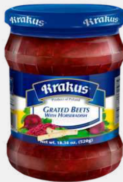
GRATED BEETS WITH HORSE RADISH BURACZKI ĆWIKŁOWE Z CHRZANEM 18.34 oz | 520 g | 6 units UPC# 820213100508