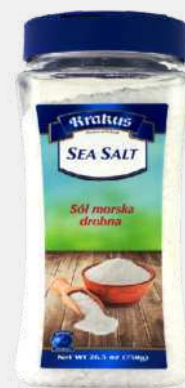
SEA SALT SÓL MORSKA 26.5 oz | 750 g | 6 units UPC# 820213136705