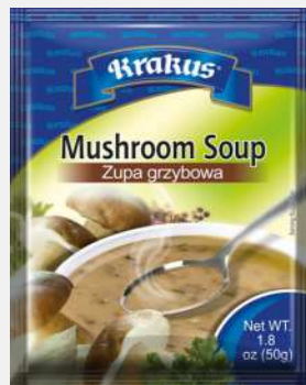
MUSHROOM SOUP ZUPA GRZYBOWA W PROSZKU 1.8 oz | 50 g | 25 units UPC# 820213137047