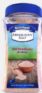
HIMALAYAN SALT SÓL HIMALAJSKA 24.7 oz | 700 g | 6 units UPC# 820213136682