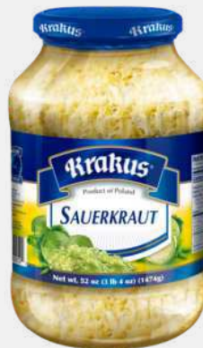
SAUERKRAUT KAPUSTA KISZONA 52 oz | 1.47 kg | 6 units UPC# 820213101451