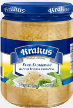
FRIED SAUERKRAUT KAPUSTA KISZONA ZASMAŻANA 16.93 oz | 480 g | 12 units UPC# 820213100904