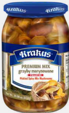
SPICY MIX MUSHROOMS PIKANTNA MIESZANKA GRZYBÓW 29.98 oz | 850 g | 6 units UPC# 820213131748