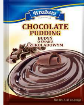
CHOCOLATE PUDDING BUDYŃ O SMAKU CZEKOLADOWYM 1.41 oz l 40 g l 30 units UPC# 820213068884