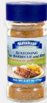
SEASONING FOR BARBECUE & RIBS PRZYPRAWA DO GRILLA I ZEBEREK 2.47 oz | 70 g | 6 units UPC# 820213136286