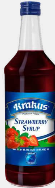
STRAWBERRY SYRUP SYROP TRUSKAWKOWY 33.8 fl oz | 1 L | 6 units UPC# 820213101819