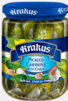
PICKLED GHERKINS WITH GARLIC OGÓRKI KORNISZONY Z CZOSNKIEM 17.64 oz | 500 g | 6 units UPC# 820213145080