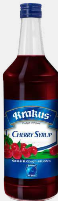
CHERRY SYRUP SYROP WIŚNIOWY 33.8 fl oz | 1 L | 6 units UPC# 820213101871