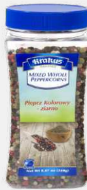
MIXED WHOLE PEPPERCORNS PIEPRZ KOLOROWY W ZIARNACH 8.47 oz | 240 g | 6 units UPC# 820213136620