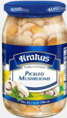
PICKLED MUSHROOMS PIECZARKI MARYNOWANE 25.7 fl oz | 760 ml | 12 units UPC# 820213101970