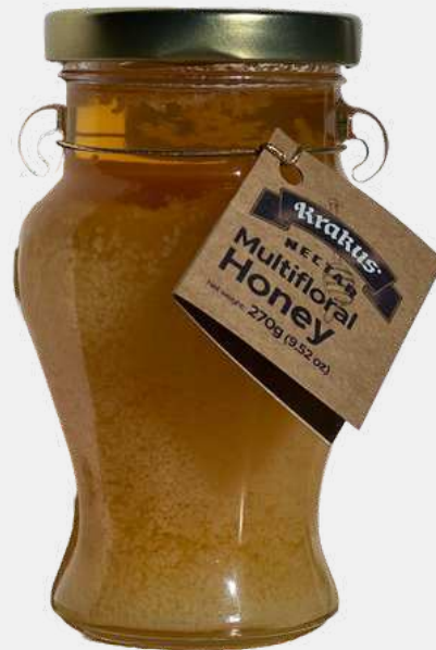
MULTIFLORAL HONEY NECTAR MIOD NEKTAROWY WIELOKWIATOWY 9.52 oz | 270 g | 6 units UPC# 820213133704