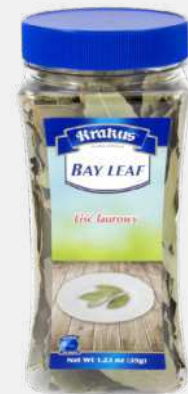
BAY LEAF LIŚĆ LAUROWY 1.23 oz | 35 g | 6 units UPC# 820213136064