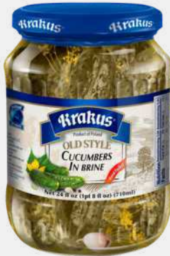
OLD STYLE CUCUMBERS IN BRINE STAROPOLSKIE OGÓRKI KWASZONE - MAŁOSOLNE 24 fl oz | 710 ml | 12 units UPC# 820213144076