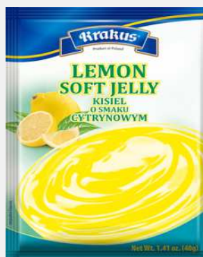
LEMON SOFT JELLY KISIEL O SMAKU CYTRYNOWYM 1.41 oz l 40 g l 30 units UPC# 820213068822