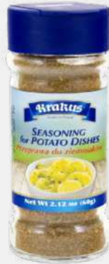
SEASONING FOR POTATO DISHES PRZYPRAWA DO ZIEMNIAKÓW 2.12 oz | 60 g | 6 units UPC# 820213136408