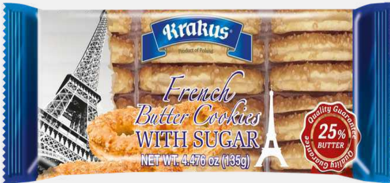
FRENCH BUTTER COOKIES WITH SUGAR PRECLE FRANCUSKIE Z MASŁEM I CUKREM 4.48 oz | 135 g | 14 units UPC# 820213130673