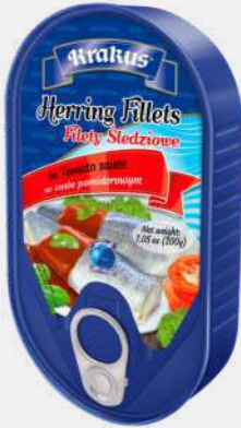
HERRING FILLETS IN TOMATO SAUCE ŚLEDZI W SOSIE POMIDOROWYM 7.05 oz l 200 g l 10 units UPC# 820213133001