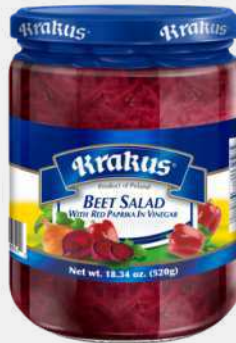
BEET SALAD WITH PAPRIKA SAŁATKA Z BURAKÓW Z PAPRYKĄ 18.34 oz | 520 g | 6 units UPC# 820213100522