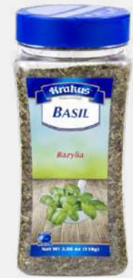
BASIL BAZYLIA 3.88 oz | 110 g | 6 units UPC# 820213136668