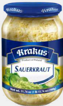
SAUERKRAUT KAPUSTA KISZONA 31.74 oz | 900 g | 12 units UPC# 820213101437