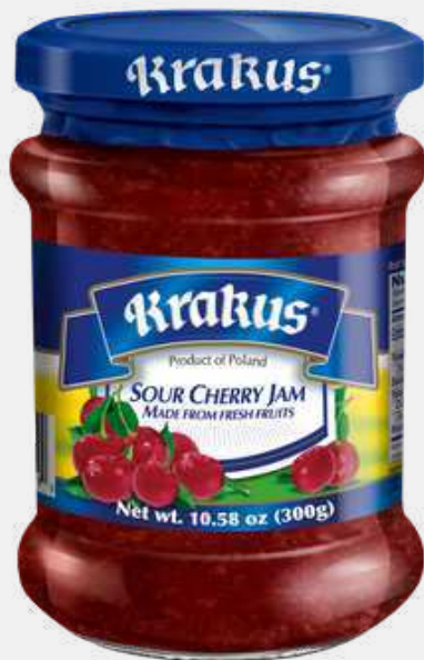
SOUR CHERRY JAM DŻEM WIŚNIOWY 10.58 oz l 300 g l 6 units UPC# 820213101857