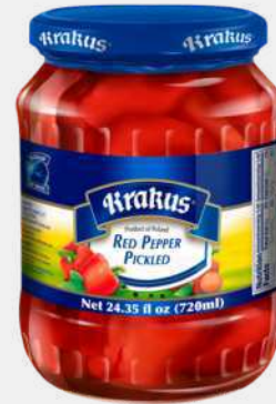
RED PEPPER PICKLED PAPRYKA KONSERWOWA 24.35 fl oz | 720 ml | 24 units UPC# 820213100645