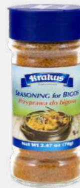
SEASONING FOR BIGOS PRZYPRAWA DO BIGOSU 2.47 oz | 70 g | 6 units UPC# 820213136446