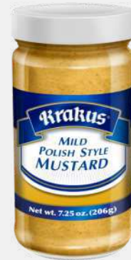
MILD POLISH STYLE MUSTARD MUSZTARDA ŁAGODNA 7.25 oz l 206 g l 12 units UPC# 820213101550