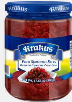
FRIED SHREDDED BEETS PAPRYKA KONSERWOWA 17.64 oz | 500 g | 12 units UPC# 820213100867