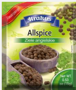
ALL SPICE ZIELE ANGIELSKIE 0.53 oz l 15 g l 20 units UPC# 820213137184