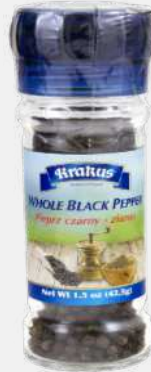
WHOLE BLACK PEPPER PIEPRZ CZARNY W ZIARNACH 1.5 oz | 42.5 g | 6 units UPC# 820213136200