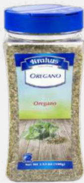
OREGANO OREGANO 3.53 oz | 100 g | 6 units UPC# 820213136644