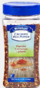
CRUSHED RED PEPPER PAPRYKA CZERWONA - PŁATEK 8.11 oz | 230 g | 6 units UPC# 820213136521