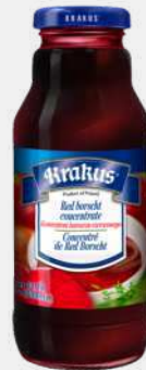
RED BORSCHT CONCENTRATE BARSZCZ CZERWONY KONCENTRAT 10.14 fl oz | 300 ml | 12 units UPC# 820213101154