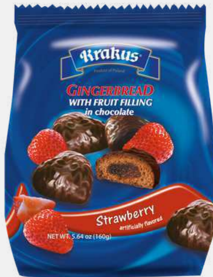
CHOCOLATE COVERED GINGERBREAD WITH STRAWBERRY-FILLING PIERNICZKI TRUSKAWKOWE W CZEKOLADZIE 5.64 oz | 160 g | 12 units UPC# 820213129004