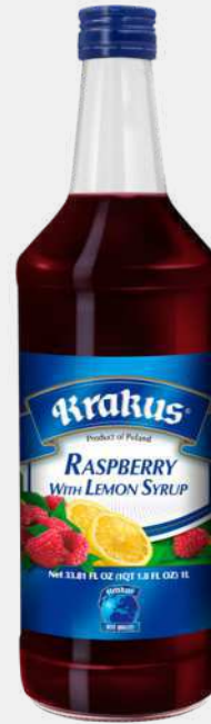
RASPBERRY & LEMON SYRUP SYROP MALINA-CYTRYNA 33.8 fl oz | 1 L | 6 units UPC# 820213123545