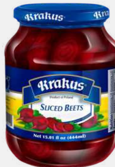
SLICED BEETS BURACZKI KONSERWOWE PŁASTRY 15.01 fl oz | 444 ml | 12 units UPC# 820213101178