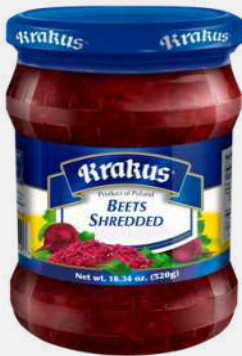
BEETS SHREDDED BURACZKI WIÓRKI 18.34 oz | 520 g | 6 units UPC# 820213100546