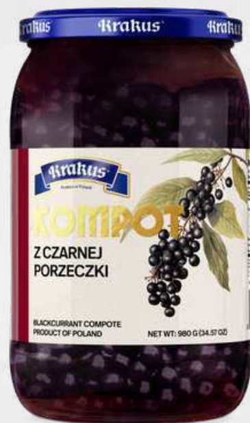
BLACKCURRANT COMPOTE KOMPOT Z CZARNEJ PORZECZKI 34.57 oz l 980 g l 6 units UPC# 820213124559