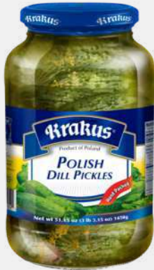
POLISH DILL PICKLES OGÓRKI KONSERWOWE 51 fl oz | 1.5 L | 6 units UPC# 820213101635