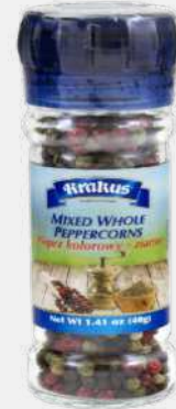
MIXED WHOLE PEPPERCORNS KOLOROWY PIEPRZ W ZIARNACH 1.41 oz | 40 g | 6 units UPC# 820213136224