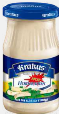
HOT HORSERADISH CHRZAN OSTRY 6.35 oz l 180 g l 12 units UPC# 820213100805