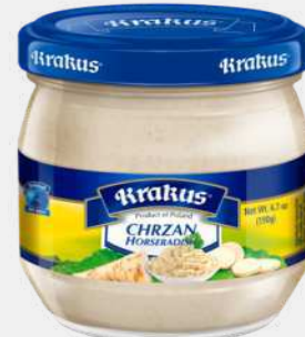
HORSERADISH CHRZAN TARTY BECZULKA 5.64