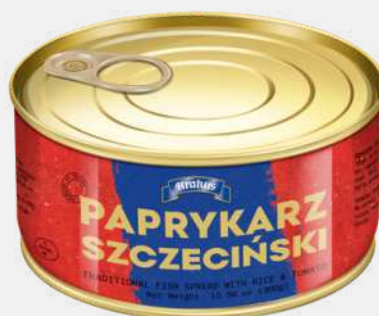
FISH SPREAD WITH RICE & TOMATO PAPRYKARZ SZCZECIŃSKI 10.58 oz l 300 g l 12 units UPC# 820213133322