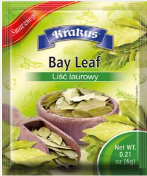
BAY LEAF LIŚĆ LAUROWY 0.21 oz | 6 g | 26 units UPC# 820213137122