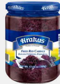
FRIED RED CABBAGE KAPUSTA CZERWONA ZASMAŻANA 17.64 oz | 500 g | 12 units UPC# 820213100881