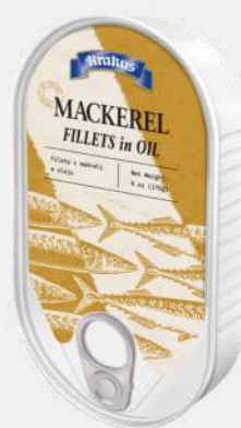
MACKEREL FILLETS IN OIL FILETY Z MAKRELI W OLEJU 6 oz l 170 g l 10 units UPC# 820213133308