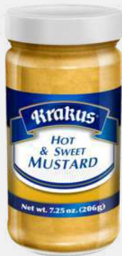
HOT & SWEET MUSTARD MUSZTARDA OSTRO-SŁODKA 7.25 oz l 206 g l 12 units UPC# 820213101574