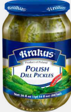
POLISH DILL PICKLES OGÓRKI KONSERWOWE 30 fl oz | 887 ml | 12 units UPC# 820213101673