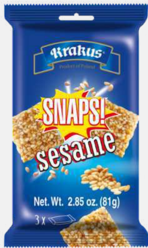
SESAME SNAPS 3-PACK SEZAMKI 3-PAK 2.85 oz | 81 g | 35 units UPC# 820213067009