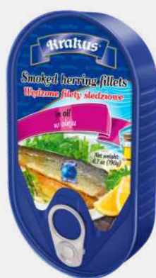
SMOKED HERRING FILLETS IN OIL WĘDZONE FILETY ŚLEDZIOWE W OLEJU 6.7 oz l 190 g l 10 units UPC# 820213133124