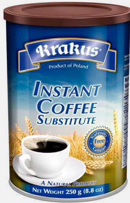
INSTANT COFFEE SUBSTITUTE TIN KAWA ZBOŻOWA - PUSZKA 8.8 oz l 250 g l 12 units UPC# 820213100201