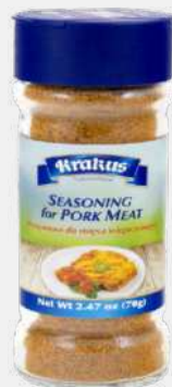
SEASONING FOR PORK MEAT PRZYPRAWA DO MIĘSA WIEPRZOWEGO 2.47 oz | 70 g | 6 units UPC# 820213136361