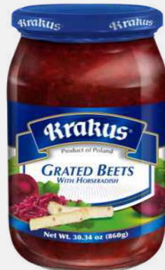
GRATED BEETS WITH HORSE RADISH BURACZKI ĆWIKŁOWE ZASMAŻANE 30.34 oz | 860 g | 12 units UPC# 820213144021