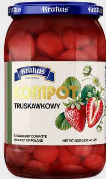
STRAWBERRY COMPOTE KOMPOT TRUSKAWKOWY 32.45 oz l 920 g l 6 units UPC# 820213124535