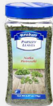
PARSLEY LEAVES NATKA PIETRUSZKI 2.47 oz | 270 g | 6 units UPC# 820213136545