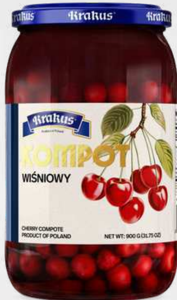
CHERRY COMPOTE KOMPOT WIŚNIOWY 31.75 oz l 900 g l 6 units UPC# 820213124528