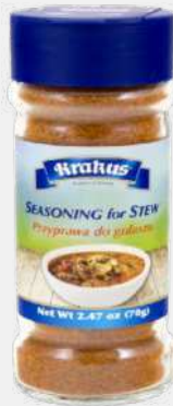
SEASONING FOR STEW PRZYPRAWA DO GULASZU 2.47 oz | 70 g | 6 units UPC# 820213136484