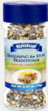
SEASONING FOR STEAK TRADITIONAL PRZYPRAWA DO STEKÓW TRADYCYJNA 2.47 oz | 70 g | 6 units UPC# 820213136125