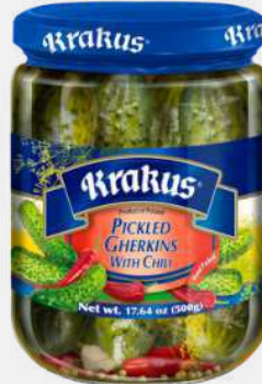
PICKLED GHERKINS WITH CHILI OGÓRKI KORNISZONY Z CHILI 17.64 oz | 500 g | 6 units UPC# 820213145066