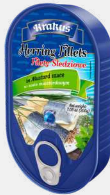
HERRING FILLETS IN MUSTARD SAUCE ŚLEDZI W SOSIE MUSZTARDOWYM 7.05 oz l 200 g l 10 units UPC# 820213133063