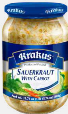
SAUERKRAUT WITH CARROT KAPUSTA KISZONA Z MARCHEWKA 31.74 oz | 900 g | 12 units UPC# 820213101413