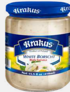
WHITE BORSCHT BIAŁY BARSZCZ 15.9 fl oz | 450 ml | 12 units UPC# 820213123248