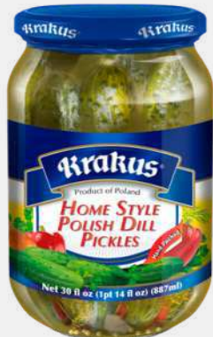
HOME STYLE DILL PICKLES OGÓRKI KONSERWOWE DOMOWE 30 fl oz | 887 ml | 12 units UPC# 820213123224