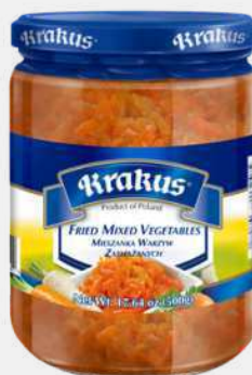
FRIED MIXED VEGETABLES MIESZANKA WARZYW ZASMAŻANYCH 17.64 oz | 500 g | 12 units UPC# 820213100843