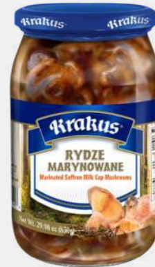
SAFFRON MILK CAP MUSHROOMS RYDZĘ MARYNOWANE 39.98 oz | 850 g | 12 units UPC# 820213123224