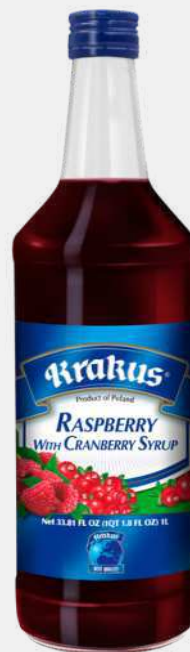
RASPBERRY & CRANBERRY SYRUP SYROP MALINA-ŻURAWINA 33.8 fl oz | 1 L | 6 units UPC# 820213123569