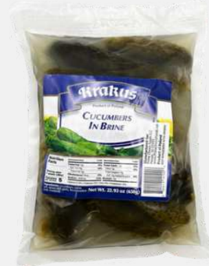
CUCUMBERS IN BRINE (BAG) OGÓRKI KISZONE 22.92 oz | 650 g | 18 units UPC# 820213141006