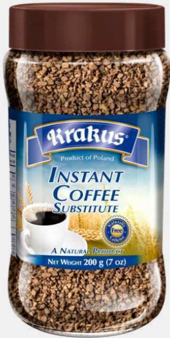
INSTANT COFFEE SUBSTITUTE JAR KAWA ZBOŻOWA - SŁOIK 7 oz l 200 g l 12 units UPC# 820213100225