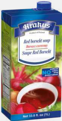
RED BORSCHT SOUP ZUPA BARSZCZ CZERWONY 33.8 fl oz | 1 L | 8 units UPC# 820213001980