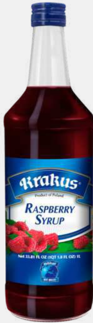
RASPBERRY SYRUP SYROP MALINOWY 33.8 fl oz | 1 L | 6 units UPC# 820213101512