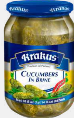
CUCUMBERS IN BRINE OGÓRKI KWASZONE 30 fl oz | 887 ml | 12 units UPC# 820213101599