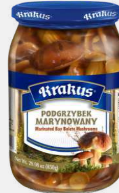
BBAY BOLLETE MUSHROOMS PODGRZYBKI MARYNOWANE 29.98 oz | 850 g | 6 units UPC# 820213131700