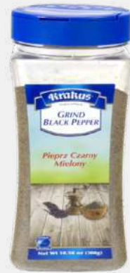
GRIND BLACK PEPPER PIEPRZ CZARNY MIELONY 10.58 oz | 300 g | 6 units UPC# 820213136569