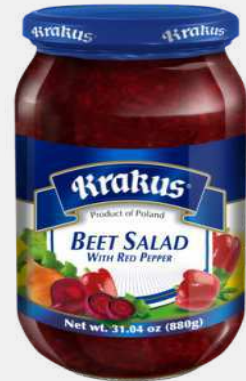
BEET SALAD WITH RED PEPPER KAPUSTA CZERWONA ZASMAŻANA 31.04 oz | 880 g | 12 units UPC# 820213144045