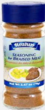
SEASONING FOR BRAISED MEAT PRZYPRAWA DO MIĘSA DUSZONEGO 2.47 oz | 70 g | 6 units UPC# 820213136309