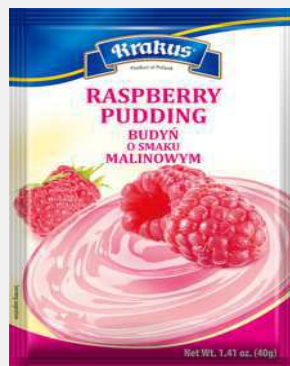
RASPBERRY PUDDING BUDYŃ O SMAKU MALINOWYM 1.41 oz l 40 g l 30 units UPC# 820213068846