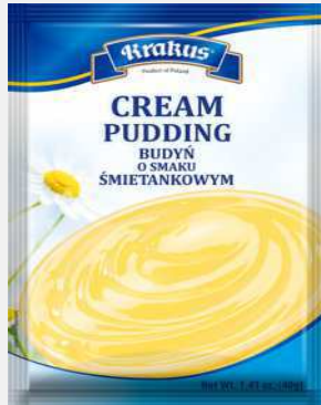
CREAM PUDDING BUDYŃ O SMAKU ŚMIETANKOWYM 1.41 oz l 40 g l 30 units UPC# 820213068860