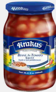
WHITE BEANS IN TOMATO SAUCE FASOLA „PIĘKNY JAS” W SOSIE POMIDOROWYM 30.43 fl oz | 900 ml | 12 units UPC# 820213128564