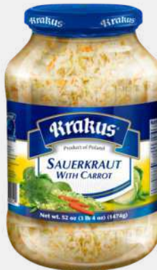
SAUERKRAUT WITH CARROT KAPUSTA KISZONA Z MARCHEWKA 52 oz | 1.47 kg | 6 units UPC# 820213101932