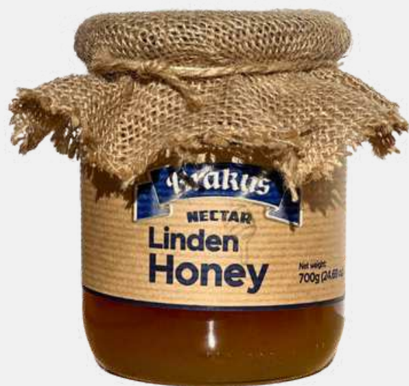
LINDEN HONEY NECTAR MIOD NEKTAROWY LIPOWY 24.7 oz | 700 g | 6 units UPC# 820213133681