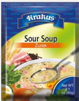
SOUR RYE SOUP ŻUREK W PROSZKU 2.11 oz | 60 g | 25 units UPC# 820213137023