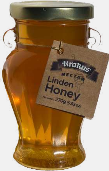
LINDEN HONEY NECTAR MIOD NEKTAROWY LIPOWY 9.52 oz | 270 g | 6 units UPC# 820213133667