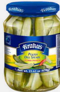
POLISH DILL SPEARS OGÓRKI CWIARTKI 23.63 oz | 670 g | 12 units UPC# 820213145004