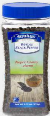
WHOLE BLACK PEPPER PIEPRZ CZARNY W ZIARNACH 9.52 oz | 270 g | 6 units UPC# 820213136583