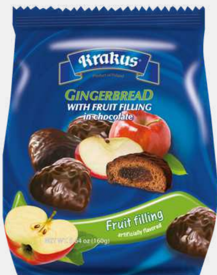
CHOCOLATE COVERED GINGERBREAD WITH FRUIT-FILLING PIERNICZKI OWOCOWE W CZEKOLADZIE 5.64 oz | 160 g | 12 units UPC# 820213129165