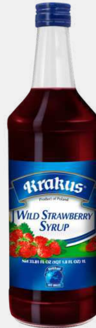
WILD STRAWBERRY SYRUP SYROP POZIOMKOWY 33.8 fl oz | 1 L | 6 units UPC# 820213100980