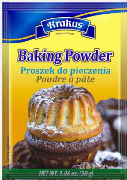
BAKING POWDER PROSZEK DO PIECZENIA 1.06 oz l 30 g l 35 units UPC# 820213068686