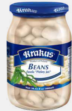
WHITE BEANS FASOLA „PIĘKNY JAS” 30.43 fl oz | 900 ml | 12 units UPC# 820213128540