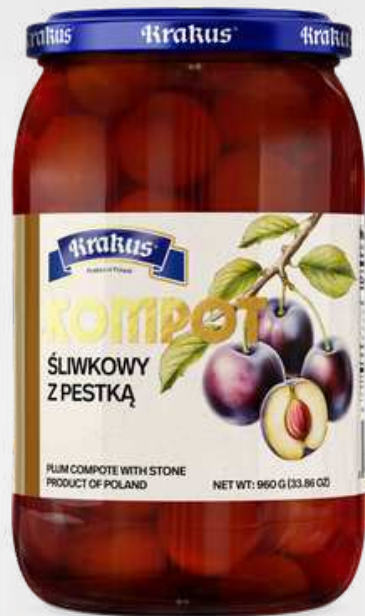
PLUM COMPOTE KOMPOT ŚLIWKOWY Z PESTKĄ 33.86 oz l 960 g l 6 units UPC# 820213124542