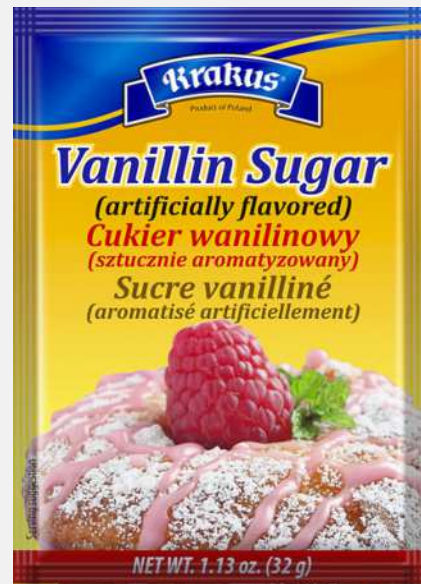
VANILLIN SUGAR CUKIER WANILINOWY 1.13 oz l 32 g l 35 units UPC# 820213068709