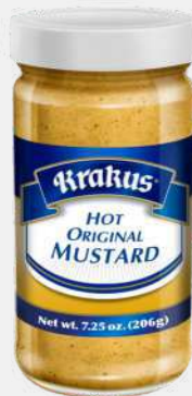
HOT ORIGINAL MUSTARD MUSZTARDA OSTRY 7.25 oz l 206 g l 12 units UPC# 820213101536