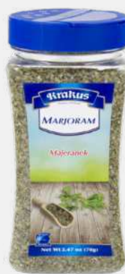
MARJORAM MAJERANEK 2.47 oz | 70 g | 6 units UPC# 820213136040