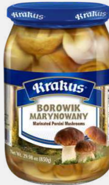
PORCINI MUSHROOMS BOROWIK MARYNOWANY 29.98 oz | 850 g | 6 units UPC# 820213131724