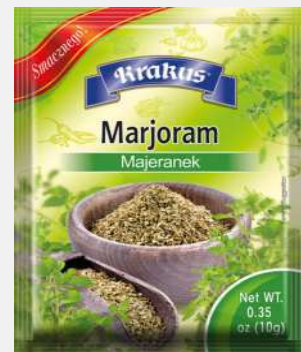
MARJORAM MAJERANEK 0.35 oz l 10 g l 20 units UPC# 820213137146