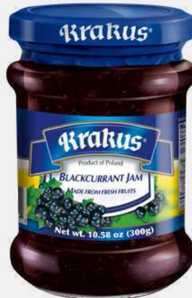
BLACKCURRANT JAM DŻEM Z CZARNEJ PORZECZKI 10.58 oz l 300 g l 6 units UPC# 820213101291