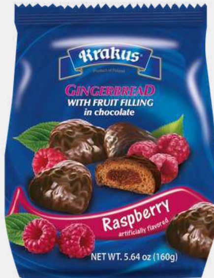
CHOCOLATE COVERED GINGERBREAD WITH RASPBERRY-FILLING PIERNICZKI MALINOWE W CZEKOLADZIE 5.64 oz | 160 g | 12 units UPC# 820213129349