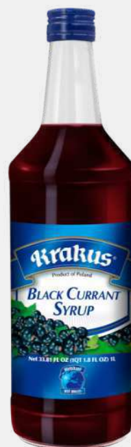
BLACKCURRANT SYRUP SYROP Z CZARNEJ PORZECZKI 33.8 fl oz | 1 L | 6 units UPC# 820213101277