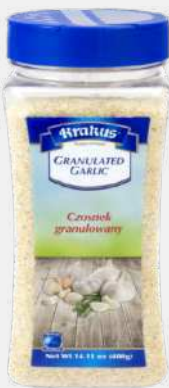
GRANULATED GARLIC CZOSNEK GRANULOWANY 14.11 oz | 400 g | 6 units UPC# 820213136606