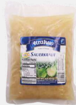
SAUERKRAUT (BAG) KAPUSTA KISZONA 31.99 oz | 907 g | 10 units UPC# 820213123408