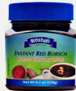
INSTANT RED BORSCHT BARSZCZ CZERWONY INSTANT 8.10 oz | 230 g | 6 units UPC# 820213136163