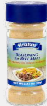
SEASONING FOR BEEF MEAT PRZYPRAWA DO MIĘSA WOŁOWEGO 2.47 oz | 70 g | 6 units UPC# 820213136248