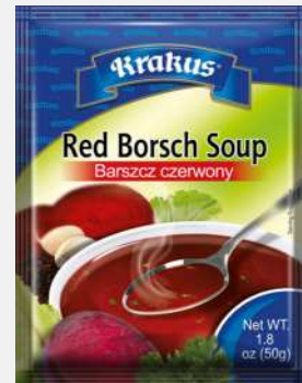
RED BORSCHT SOUP BARSZCZ CZERWONY W PROSZKU 1.76 oz | 50 g | 25 units UPC# 820213137009