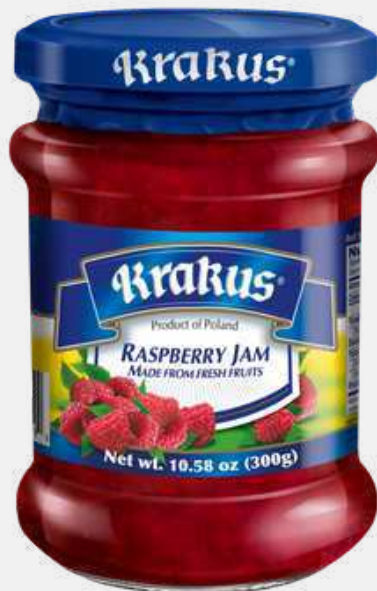
RASPBERRY JAM DŻEM MALINOWY 10.58 oz | 300 g | 6 units UPC# 820213101499