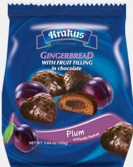
CHOCOLATE COVERED GINGERBREAD WITH PLUM-FILLING PIERNICZKI ŚLIWKOWE W CZEKOLADZIE 5.64 oz | 160 g | 12 units UPC# 820213129189