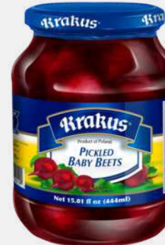
PICKLED BABY BEETS BURACZKI KONSERWOWE CAŁE 15.01 fl oz | 444 ml | 12 units UPC# 820213101192