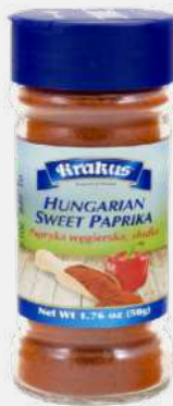
HUNGARIAN SWEET PAPRIKA SŁODKA WĘGIERSKA PAPRYKA 1.76 oz | 50 g | 6 units UPC# 820213136187