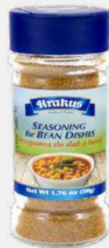
SEASONING FOR BEAN DISHES PRZYPRAWA DO DAŃ Z FASOLI 1.76 oz | 50 g | 6 units UPC# 820213136385