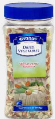
DRIED VEGETABLES WŁOSZCZYZNA SUSZONA 5.6 oz | 160 g | 6 units UPC# 820213136101