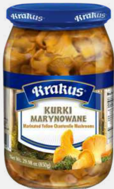
YELLOW CHANTERELLE MUSHROOMS KURKI MARYNOWANE 29.98 oz | 850 g | 6 units UPC# 820213131786