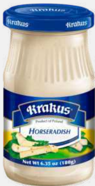
HORSERADISH CHRZAN 6.35 oz l 180 g l 12 units UPC# 820213101253